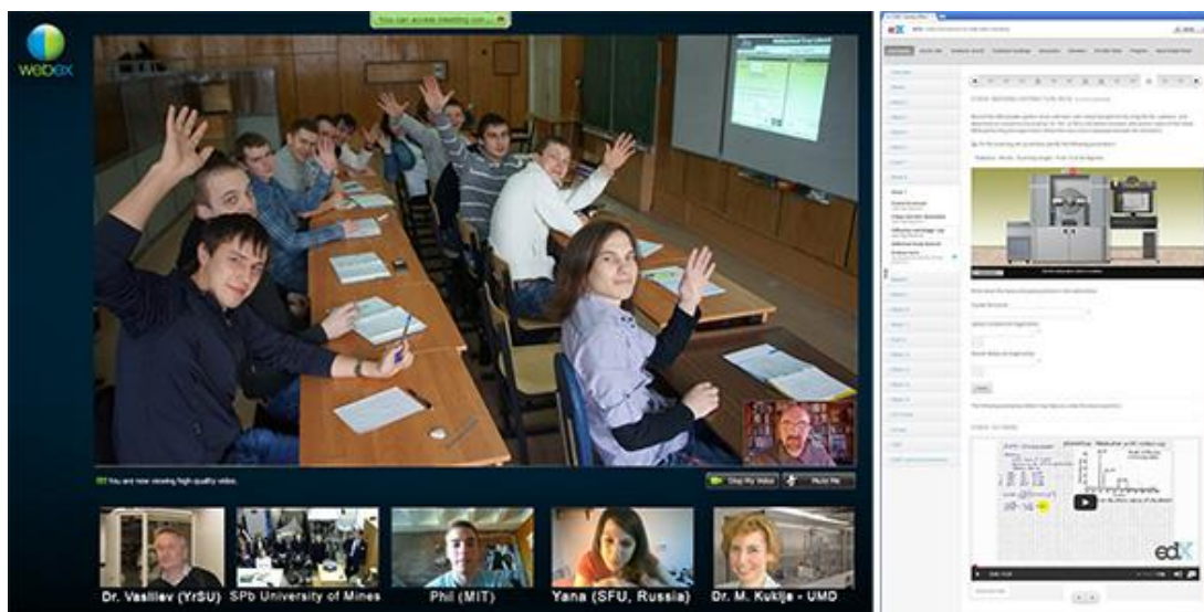
Figure 2. Screenshots of a virtual experiment (left); Students and faculty of the U.S. and Russian universities jointly perform an online experiment using the v-XRLab and communicating via WebEx (right); v-XRLab embedded into the MITx course running on the edX MOOC platform (far right).

A complementary authoring tool enabled instructors to easily create new experiments and modify the existing ones to better match specific course objectives or training needs. The experiments could be substantially different to match the great diversity of course subjects, student majors, educational goals and settings. The collection of virtual samples available for online experimentation included alloys, ceramics, polymers, nanostructured materials, and thin films. Instructors were able to add their own virtual samples to the collection.