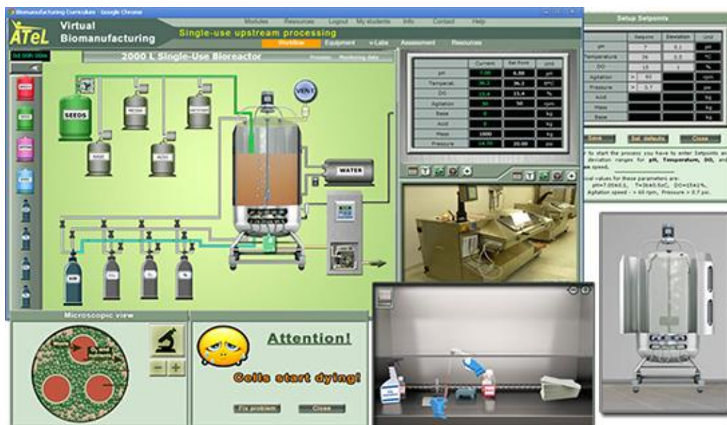
Figure 3. Screenshots of the Cell Growth lab, where a student can virtually assemble a disposable bioreactor and related production system and calculate an initial amount of buffer and cell culture. Then, he/she loads the system and controls the cell growth and performs the required procedures such as calibrating sensors, taking and analyzing probes, maintaining the appropriate temperature and atmosphere, etc. The system imitates abnormal situations involving the student in troubleshooting. The microscopic view visualizes the processes occurring in-side the bioreactor.

The cloud-based interactive and comprehensive virtual Single-use Biomanufacturing Learning Environment has been developed and implemented to address the needs of biopharmaceutical education and professional training. It includes a set of simulation-based v-Labs, virtual production line, as well as online lessons, assessments, a glossary, and supporting materials.