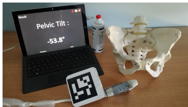
Figure 1: Pelvic tilt measurement device

The pelvic tilt measurement device is composed of a L12-5L60N US probe from TELEMED ® connected to a Microsoft Surface Pro ® tablet having an embedded accelerometer (figure 1). The 3D localization of the US probe is determined with an ARUCO marker (Garrido-Jurado, Muñoz-Salinas, Madrid-Cuevas, & Marín-Jiménez, 2014; Garrido-Jurado, Muñoz-Salinas, Madrid-Cuevas, & Medina-Carnicer, 2016) attached to the probe and localized by the tablet front-facing camera. Both the camera and the US probe have been beforehand calibrated according to the approaches described in the PLUS open-source toolkit (Lasso et al., 2014). The Anterior Pelvic Plane (APP) is determined by acquiring both iliac spines and the pubic symphysis with the US probe. The pelvic tilt is determined by computing the angle between the APP and the vertical provided by the tablet accelerometer.