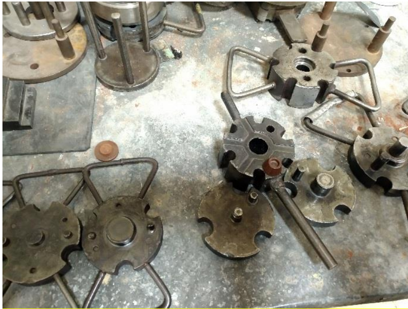
Figure 3. A set of molds.

For work, we used a PG-20 press, which is shown in Fig. 3. and a set of molds shown in fig. 4.