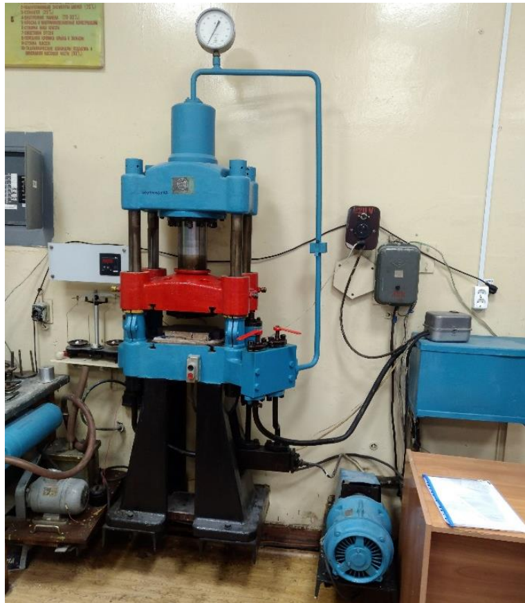
Figure 3. Press PG-20.

The chamber is evacuated by a vacuum system (7), the working vacuum is \sim 1 Pa (in the cold state). The filling of the working gas into the chamber and the control of the working medium inside the chamber is provided by the gas supply system (8). The water-cooling system (9) is designed to cool the power supply rectifier, the walls of the vacuum chamber, flexible current leads and copper shoes.