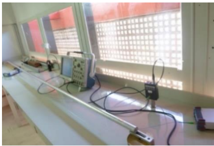
Fig. 1 Experimental arrangement used for the detection of transverse or longitudinal pulses traveling along an aluminum bar.

Figure 1 shows the experimental arrangement used to measure the velocities of the transverse and longitudinal pulses propagating in an aluminum bar simply supported at its ends. Two LPG grating written in SMF28 commercial mode mono optical fiber, using CO 2 laser, are located near the ends of the 3 m long bar. Transverse and longitudinal pulses are originated in the bar hitting one of its ends in a perpendicular or collinear way to its length. The pulses are detected by the deformation of the LPGs due to the passage of the pulses. An oscilloscope is used to detect the disturbance in the power transmitted by the LPGs. The speeds are calculated by measuring the distance between the LPGs and the difference in the time elapsed between the detections in both LPGs.