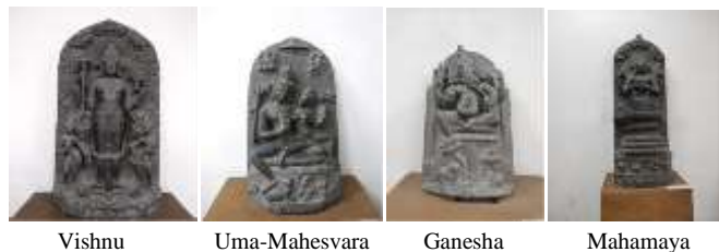
Fig. 1. Sample images from our dataset

Here are some samples of object from our dataset