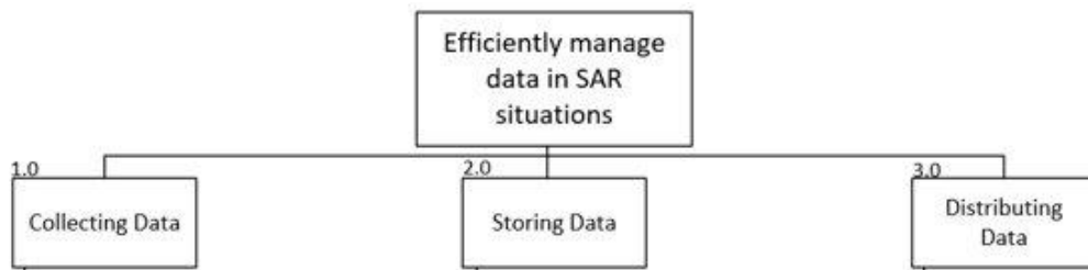
Figure 1: Functional Hierarchy

First-level SAR operations involving the victim(s) and the emergency responder who first received the distress signal can be shown in a linear matter, where each party is a key actor in the flow of information pertaining to the distress alert. The figures below will help depict the functions needed to determine how data is best distributed and how AI can be implemented to create outputs focused on improving response times. The functional hierarchy shown in Figure 1 was developed to depict the main functions of a conceptual app. The purpose of this diagram is to show how incoming information is interpreted, categorized, and assessed to create alternative outcomes for decision-makers. The fundamental objective to efficiently manage data flow in SAR operations is divided in three main functions: collecting data, storing data, and distributing data.