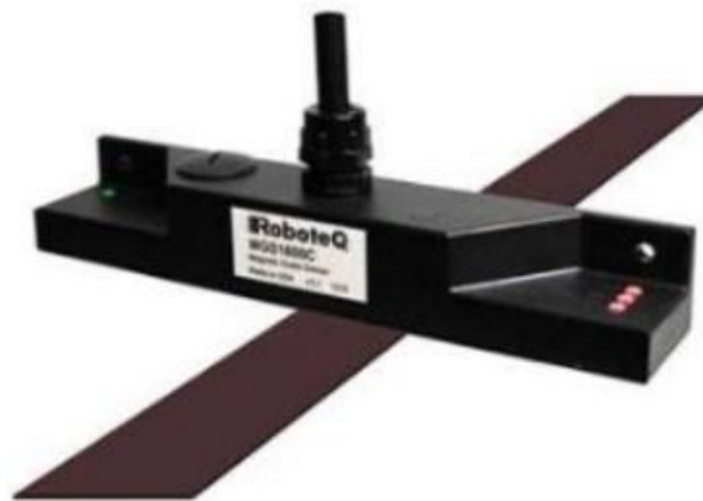
Fig.3 Magnetic Tape and sensor [1]