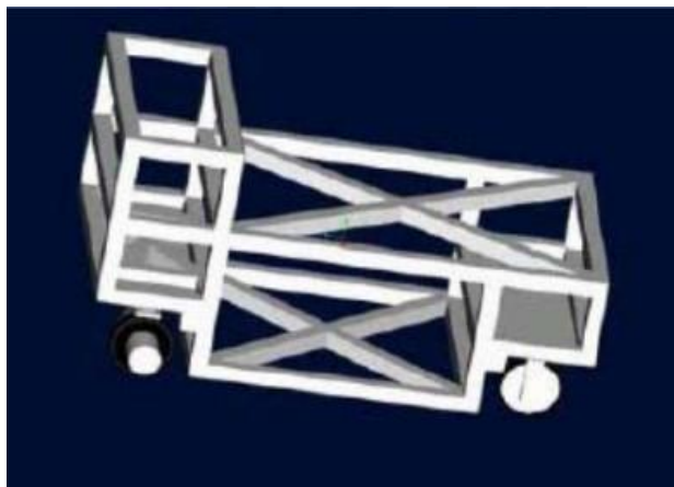
Fig,2 AGV frame design [2]

[2]The design of the AGV represents a large role in the tasks to be performed. The central elements of the vehicle perform the actual transport task. Other elements are used as input or active signal elements of the AGV. All of these correspond to the central factor and the combination of all factors leads to the actual performance of the AGV missions.