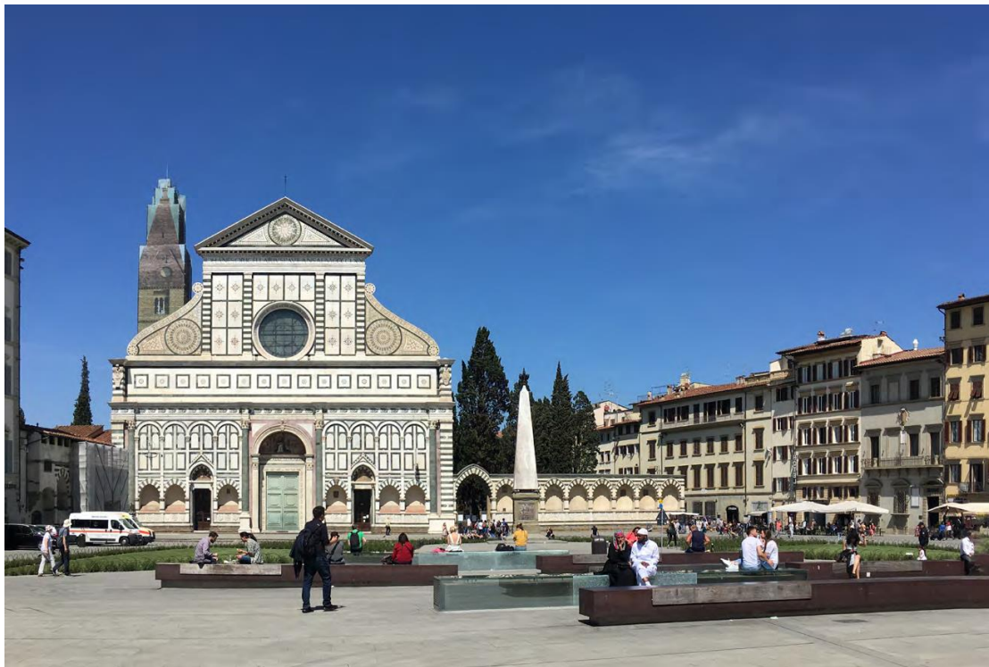
Fig.1 - Urban Furniture in the Santa Maria Novella Square, Florence.

A beautiful and comfortable home cannot be separated from carefully selected and cleverly designed furniture. For such a large and complicated family as the city, the citizens long for the city they lived to be as comfortable, tidy, warm and beautiful as home. The streets and settlements of the city carry the daily activities of the citizens in the "big family" and are the places where these activities take place. These facilities attached to or placed on the streets are just like the "furniture" which provide service to the members of the "big family". The concept of urban furniture is generated and widely used as the road shifts from satisfying the single demand for transportation to satisfying the compound demand of people, full of humanistic care. It corresponds to the spatial environment elements of "street" and will play an increasingly important role with the improvement of urban design and environmental quality (Fig. 1).