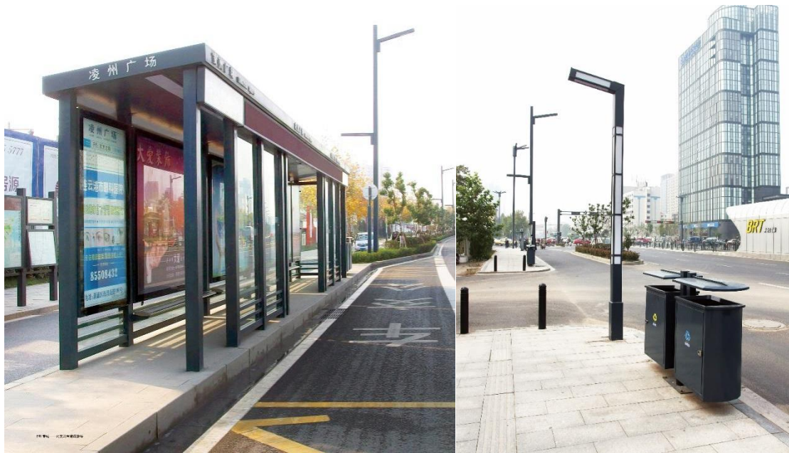
Fig.5 - Lianyungang BRT Line 1 Project Urban Furniture. (credits: Shude Song, 2010).