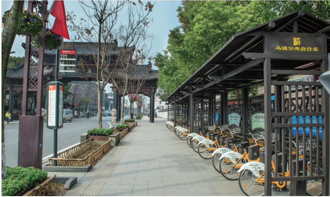
Fig.2 - Street View of Wuzhen.