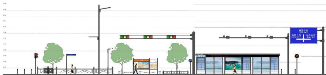
Fig.4 - Facade of Lianyungang BRT Street Furniture System.

The relationship between integrated urban landscape and urban furniture is closely related. In view of this, according to the development concept of modern cities, combining the functional attributes of urban furniture with the urban management attributes to form a system of systems, it is beneficial to each type of system to list the relevant facilities, as well as contribute to the specific design, implementation and the docking work with related authorities. The specific types of furniture in the six systems can be increased or decreased depending on the type, location, attributes and needs of the street. The 33 categories in the figure are the more conventional types of urban furniture.